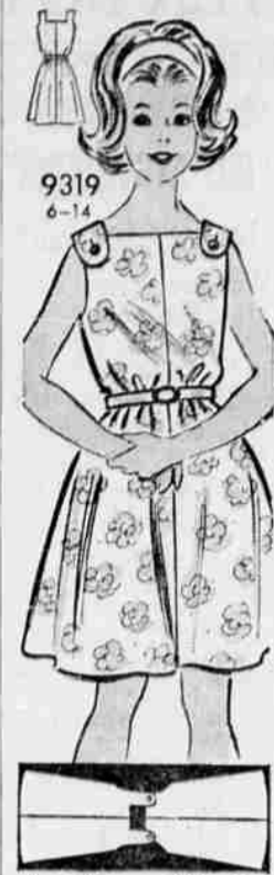
by Marian Martin

Easiest ever 2 main pattern parts plus facings! Choose poplin or denim for this sun-fun hit daughter can wear belted or free and easy. Be smart, sew and save!