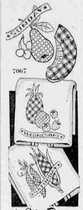
by Alice Brooks

Turn towels into eye-pleasing treats with one-day fruit and vegetable designs.