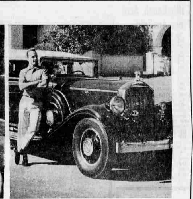
Phil Hill with his 1931 Pierce Arrow Town Cabriolet. Shell products help him keep this classic automobile in "mint" condition.