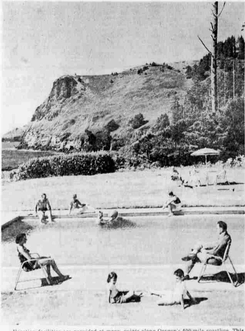
Vacation facilities are provided at many points along Oregon's 400-mile coastline. This spot is in the Depoe Bay area.