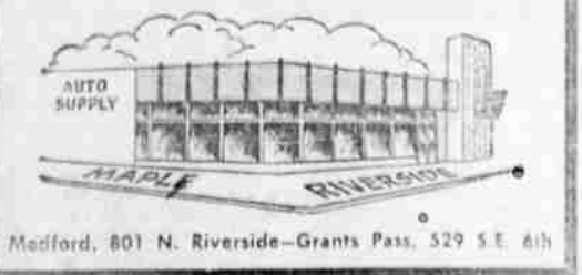
Medford, 801 N. Riverside—Grants Pass, 529 S.E. 6th

Regional Edition Page 2-A MEDFORD TRIBUNE MEDFORD, OREGON, WEDNESDAY, JULY 11, 1962