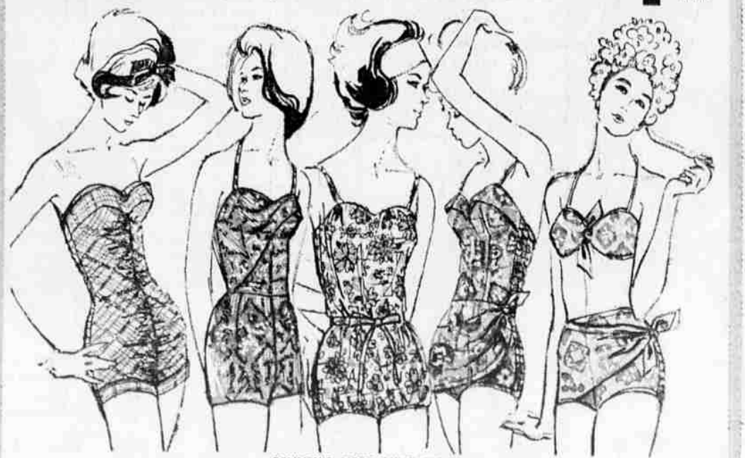
PENNEY'S MEZZANINE FLOOR!

EXTRA • cottons, long wear weaves • stay fresh prints • 1-piece style selection • 2-piece adjustable bikinis • flattering shirred backs • hi-fashion detailing $4 each