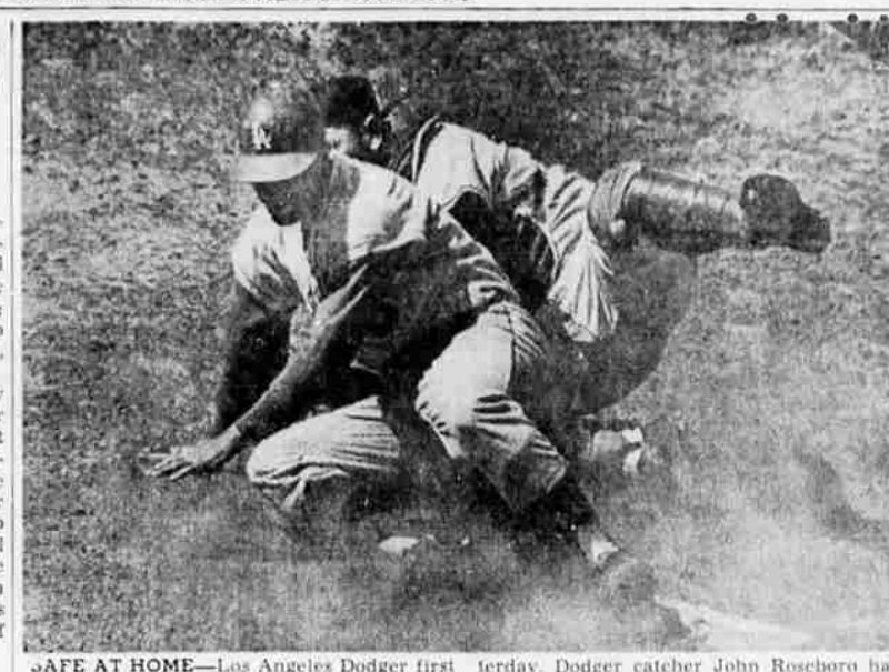
SAFE AT HOME—Los Angeles Dodger first baseman Ron Fairly bowls over San Francisco Giants catcher Ed Bailey as he slides home safely in the ninth inning of National league baseball game at San Francisco yesterday.

terday. Dodger catcher John Roseboro had doubled to left centerfield. Leftfielder Will McCovey relayed the ball to shortstop Jose Pagan who threw too late to Bailey. The Dodgers won 11-3. (UPI)