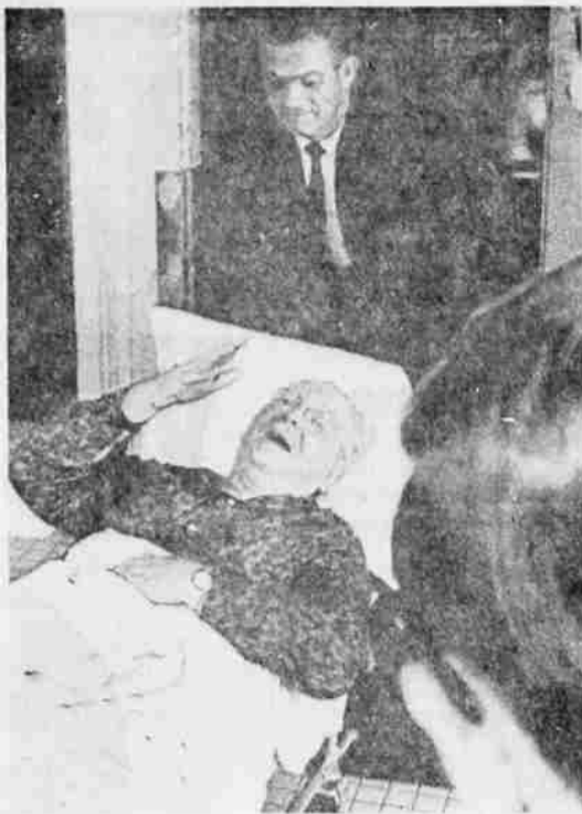
BACK IN HOSPITAL —Sgt. Alvin C. York waves to newsmen at Nashville, Tenn., as he enters the same hospital from which he was released 22 days ago. This time the World War I hero will have an operation for prostate gland trouble. In his usual jolly way he quipped at the ambulance driver to "Take it easy, there's a man in here" when he was being carried to the entrance.