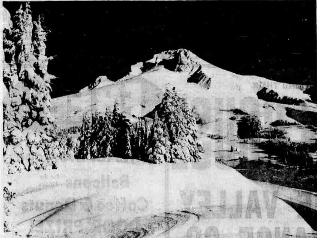
A bright winter sun highlights scenic beauty of Oregon's Mt. Hood, recognized as one of the northwest's finest and most popular skiing areas.