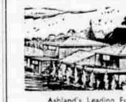
Ashland's Leading Funeral Director Since 1935

LITWILLER FUNERAL HOME Highway 66 at Normal Ave. Ashland — Dial 482-2816