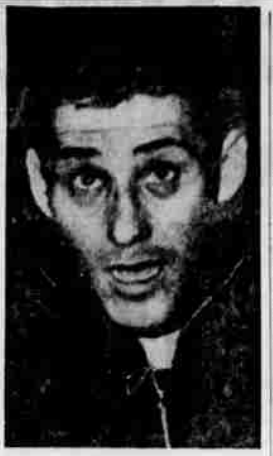
JIM BEATTY Runs Record 2-Mile