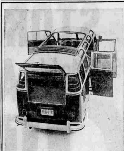
© 1962 VOLKSWAGEN OF AMERICA, INC.