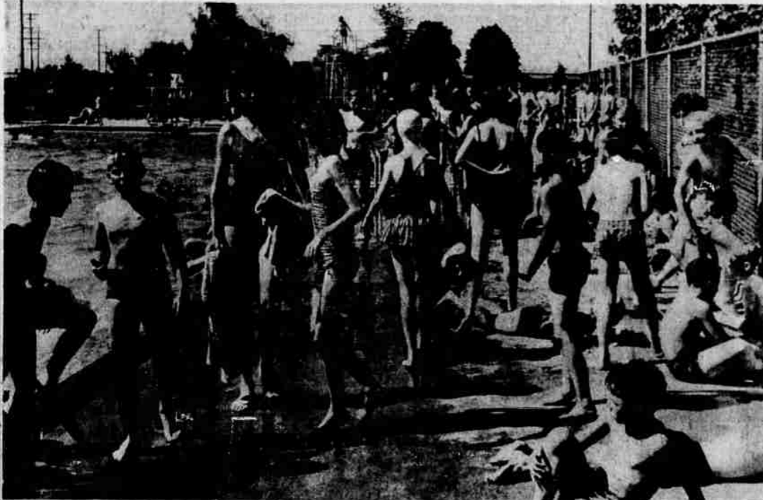
POOL OPENING — With another school year behind them, hundreds of Medford youngsters happily dunked themselves in the water, or basked in the warm sun Friday afternoon on the opening day of Hawthorne and Jackson pools.

To report improper or non-delivery of the Mail Tribune in Medford, phone 732-4141; Astoria call at 1224 Iowa st. or phone 482-3092; Montague and Yreka phone Globe 9-1171 before 8:45 p.m. daily and 10:30 a.m. Sunday.