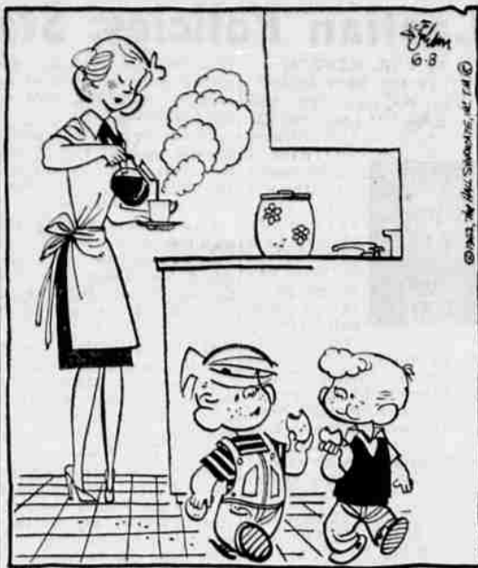
"I HAD SOME COFFEE ONCE. IT TASTES LIKE BLACK WATER!"