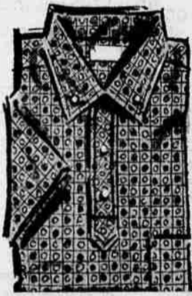
Handsome new 3/4 sleeve placket front button down. 2.98