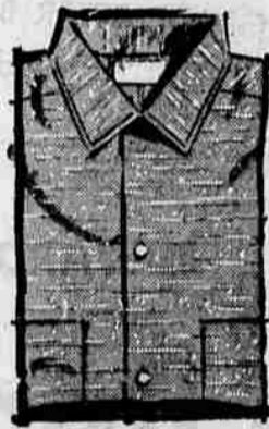
Cotton Acapulco weave in pastel colors. 1.98