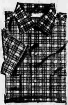
New Dan River woven plaids. 2 matched pockets! Easy care! 2.49