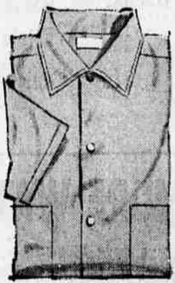
Combed cotton broadcloths! Solids! Pastels! Machine wash! 1.98