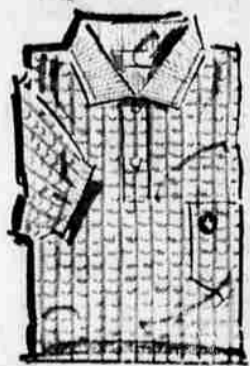
Surfact interest cotton knit. Fashion collar. Emblem on pocket. 3.98