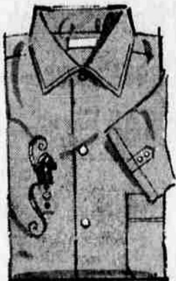
Polished rayon challis! New embroidered motifs! 8 colors! 2.98