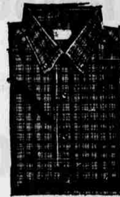
Edwardian prints short sleeve pullover style button down collars! 2.98