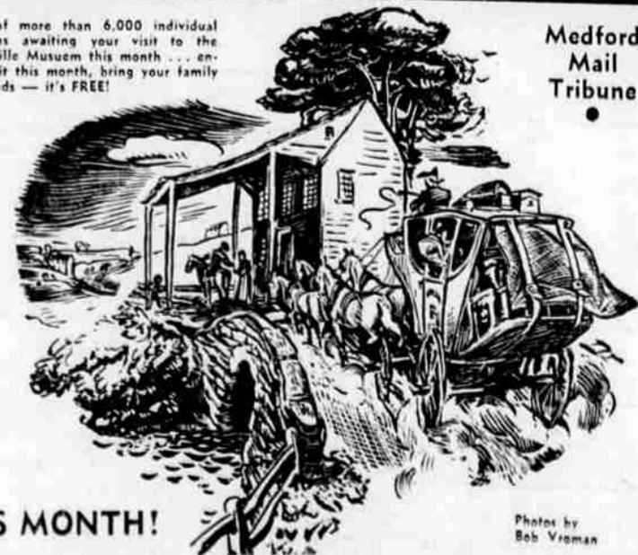
Medford Mail Tribune