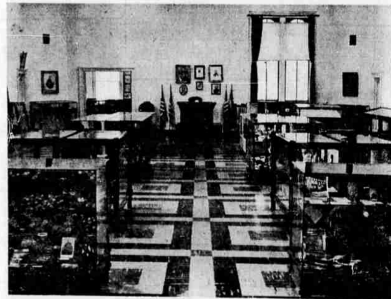
A few of more than 6,000 individual collections awaiting your visit to the Jacksonville Museum this month... enjoy a visit this month, bring your family and friends — it's FREE!

Visit YOUR Jacksonville Museum THIS MONTH!