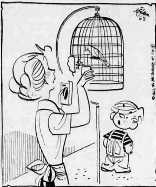
"WELL, IF HE'S NOT A WILD CANARY, HOW COME YA KEEP HIM IN A CAGE?"