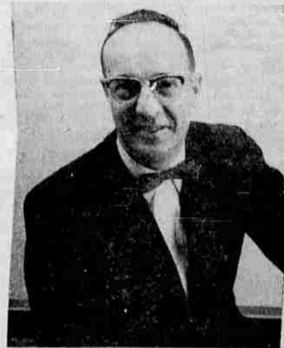
Omar the Rug Merchant

"Choose rugs and carpet of good quality from 50c to $1 per month more will add years of wearable beauty to your carpet." (S.M.)