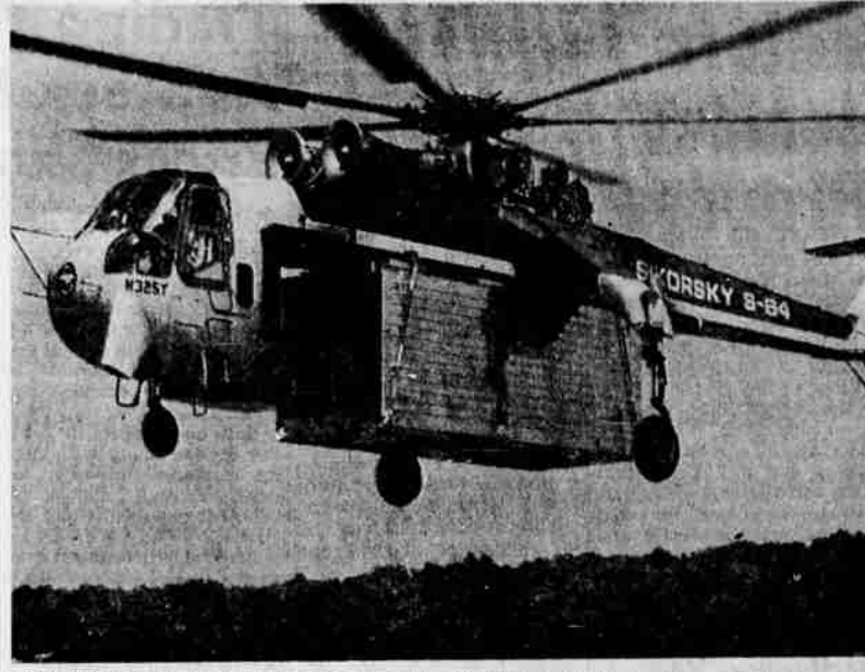
'CRANE' DEMONSTRATED—The Sikorsky S-64 Skycrane was demonstrated publicly this noon at the Sikorsky plant in Stratford, Conn. The S-64, shown carrying an 8 by 20 foot truck trailer, is expected to have wide military and commercial applications, including logging. The helicopter is expected to be tested in logging operations in southern Oregon this fall.

The society emphasized that the vaccine to be given next week end is not a booster dose to that given three weeks ago, but provides permanent immunity from a separate polio virus. There are three known viruses which cause polio, doctors said, and each dose of Sabin vaccine provides immunity to a separate virus.