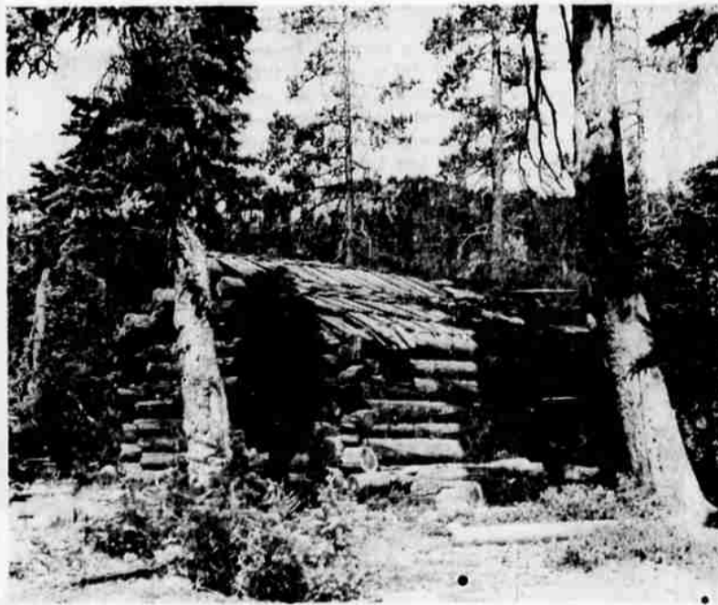
This picturesque cabin on the Skyline trail near Horseshoe lake makes one wonder who built it, and for what reason. It withstood many winters of deep snows and now seems to blend into its wilderness setting.