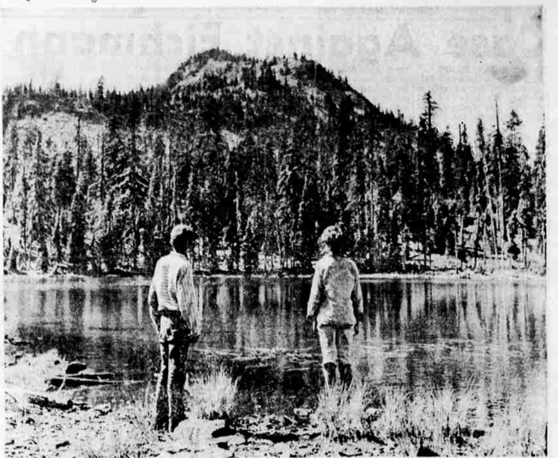
From Horseshoe lake, Mt. Luther appears to be not much more than a hill of rock. Several years ago a group of girl scouts reported that they had hiked to the top of the mountain to watch the moon rise. They returned to their camp at lake Margaret by moonlight.