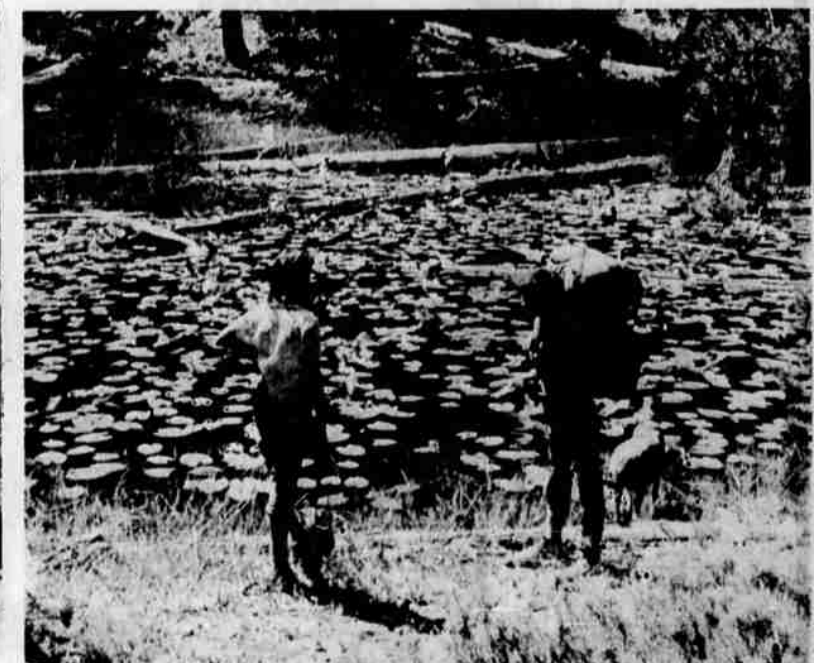
Along the Skyline trail south of Seven Lakes basin one comes upon many pleasant surprises. Here a small pond, covered with bright yellow blooms, is observed by two young hikers.