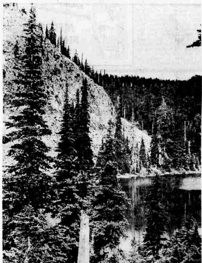
Located in an area that is more remote than most, Tsuga lake in the Sky Lakes group is the home of at least one pair of eagles. Mountain lakes are often fed by underwater springs and have no outlet except for seepage.

SECTION B MEDFORD, OREGON, SUNDAY, MAY 27, 1962 PAGES 1 to 8