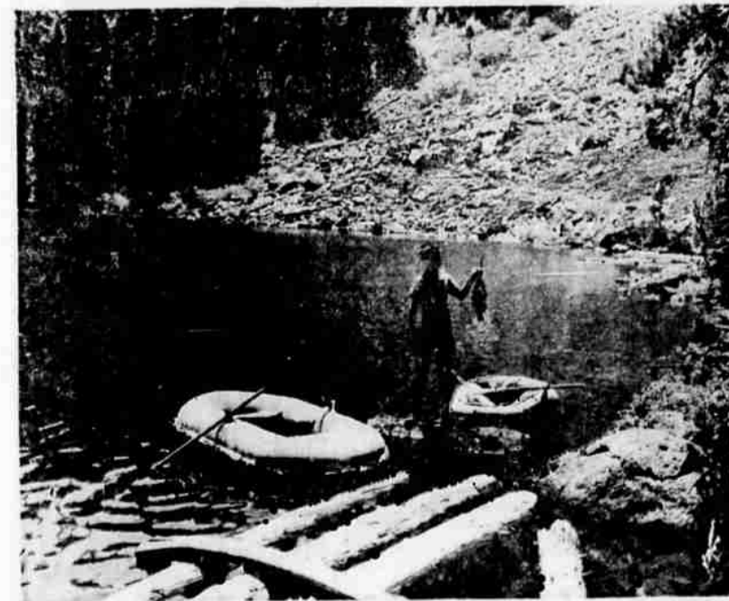
A young fisherman, above, displays a catch of pan-sized eastern brook trout taken from Blue lake in Blue canyon. The use of motor boats is prohibited in these areas—