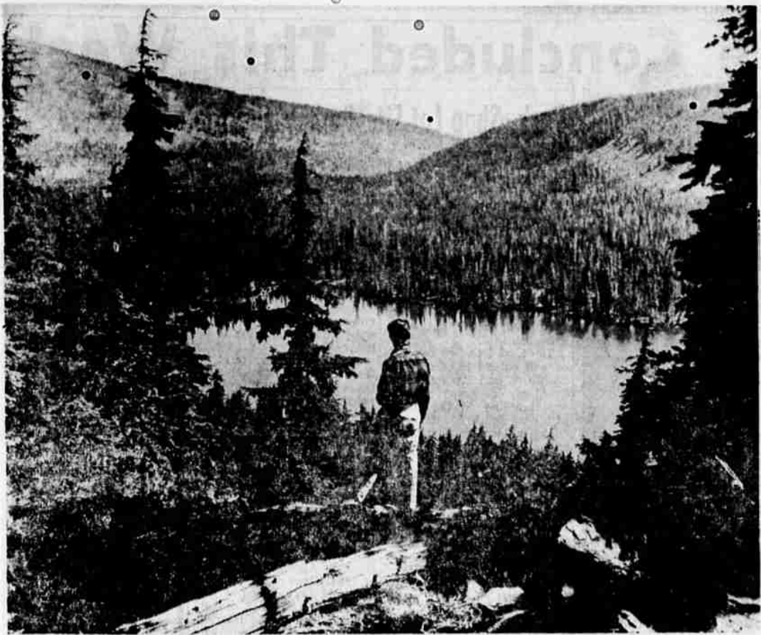
Harriett lake in the Mountain Lakes primitive area is a jewel among lakes. Its water is clear and cold and it appears exceptionally deep where a huge rock slide meets the water's edge. It is seen here from the ridge on the south entrance trail.