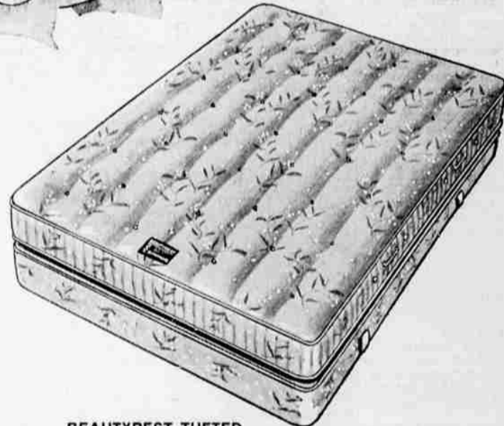
BEAUTYREST TUFTED World's most famous, most popular mattress in an eye-pleasing blue tone cover. Twin or full size still only . . . . . $79 50

Beautyrest . . . the happiness money can buy