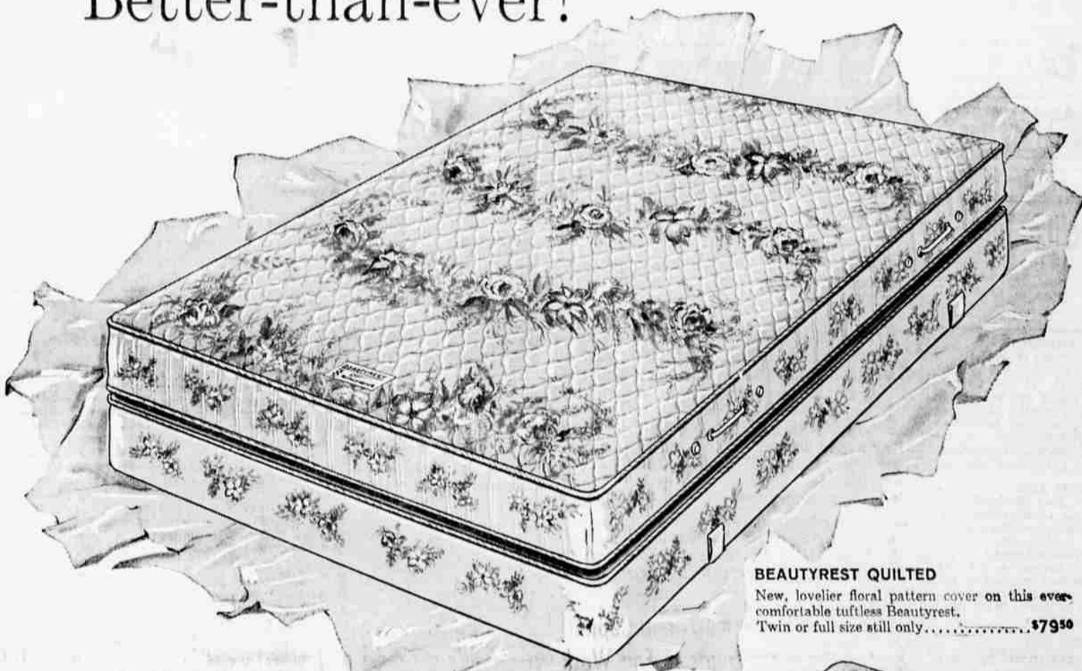
BEAUTYREST QUILTED New, lovelier floral pattern cover on this ever-comfortable tuftless Beautyrest. Twin or full size still only . . . . . $79 50