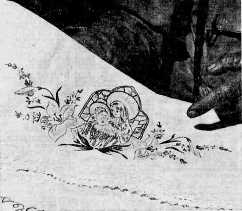
FANCY PILLOWCASE —This closeup shows one of numerous pillowcases, scarves and aprons he has made as a spare-time hobby. bus driver, embroidered on a pillowcase.