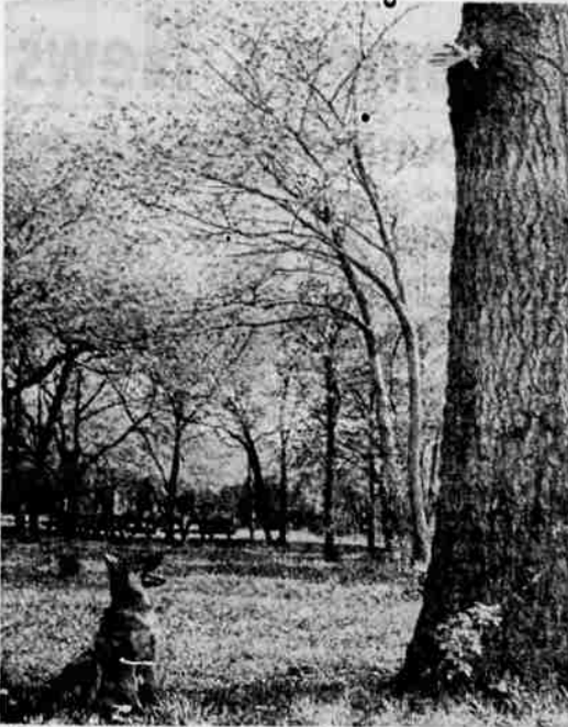
YIKES! —Checkers, a Chicago canine, encountered a strange sight as he looked up a tree in Schiller Woods forest preserve when he saw a pair of hands protruding from a hole in a tree. What Checkers didn't know was that a girl had climbed the tree to perform the trick.

Moscow —(UPI)—The newspaper Red Star said Saturday a military accessories factory in Leningrad was converted by crooks into a private plant producing pens, folders and shaving goods.