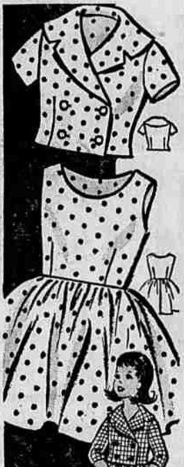
9083 SIZES 2-10 by Marian Martin

Out on a breezy day goes your little girl looking fresh and pretty in the dress and jacket - off she goes on sundays in the dress alone! Sewing? Easy!