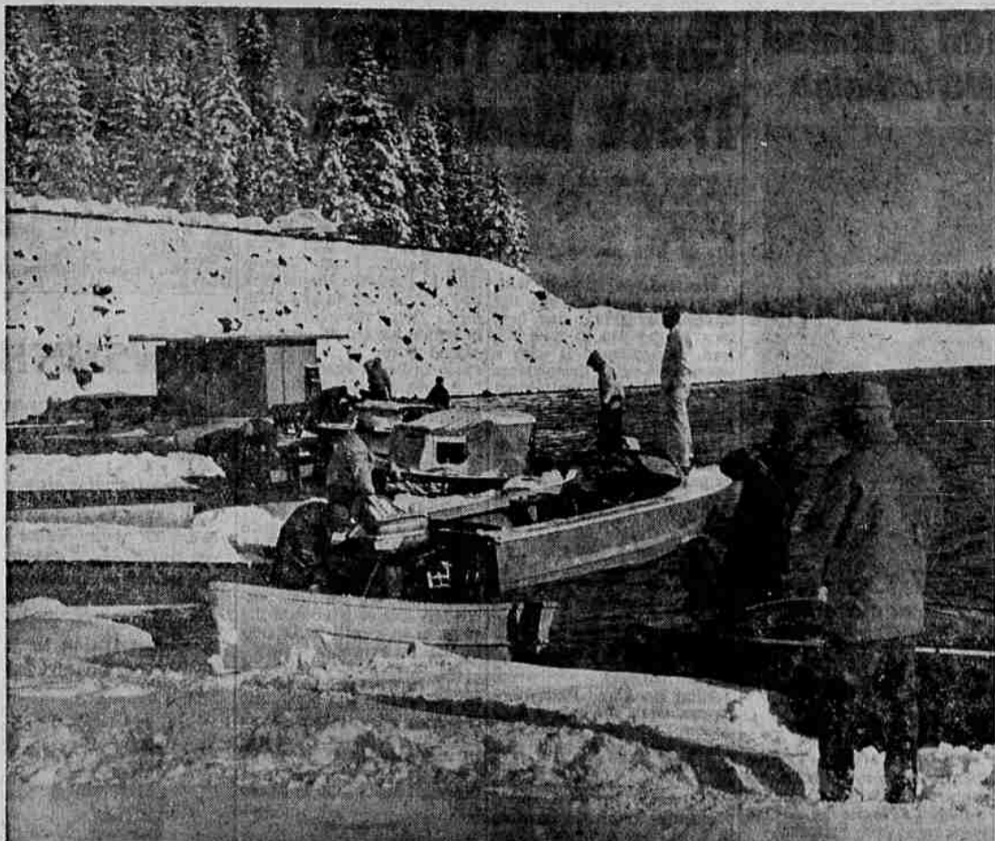
HARDY SOULS —With a foot of snow on the ground and the temperature dipping below the freezing point, it took a lot of grit and at least one pair of "longies" to endure a boat ride on Howard Prairie lake early Saturday morning. Only a handful of persons were on hand at the crack

of dawn, but a large number of cars were noted coming in a little later. Many parties, like those pictured above, braved the cold and were rewarded with nice catches of trout.