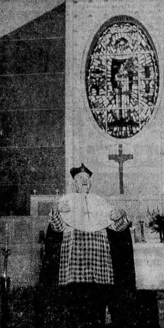
NAME CHANGED—Richard Cardinal Cushing is shown officiating at a high mass in a new church. He had to change the name from St. Philomena to the Most Precious Blood of Jesus after an announcement came of the Vatican's action striking the name of Philomena from the rolls of Christian saints. The stained glass window (background) of the deposed saint must be replaced.