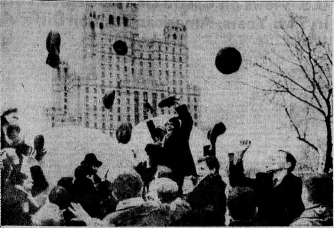
RUSSIANS JOYOUS —Young Muscovites at the planetarium in Moscow jump for joy at the news that a Russian was the first man into space.