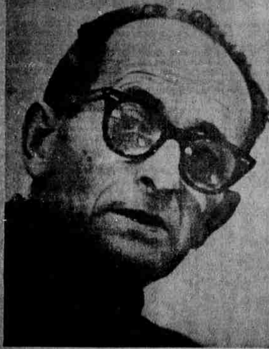
AT TRIAL —Adolf Eichmann is shown during his trial in Jerusalem when he heard the prosecutor brand him as "the man who tried to exterminate the Jewish people" and defend Israel's right to bring him to judgment.