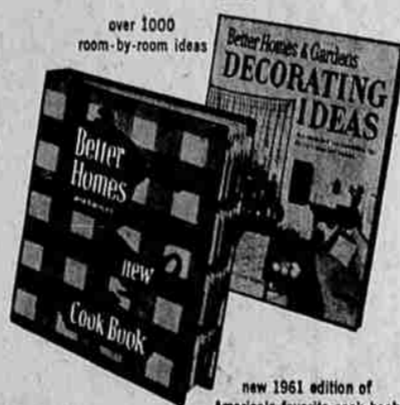
new 1961 edition of America's favorite cook book

Two best-selling homemaking books—Better Homes and Gardens New Cook Book and Decorating Ideas Book... a total value of $6.90. YOURS AS A GIFT with the purchase of a 45-piece set of