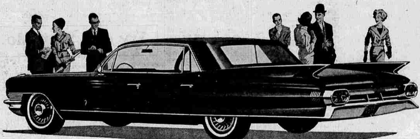
Fleetwood 60 Special

that for this occasion we will have on exhibit certain superb Cadillac models which you might not ordinarily have an opportunity to see. While you are here, we will be happy to arrange a demonstration drive at a time convenient to you, and to explain how very easily you can become the owner of a 1961 Cadillac.