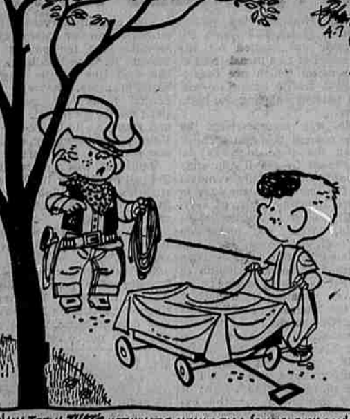
"NAW, JOEY, THAT'S NOT WHAT I MEANT BY A 'COVERED WAGON!'"