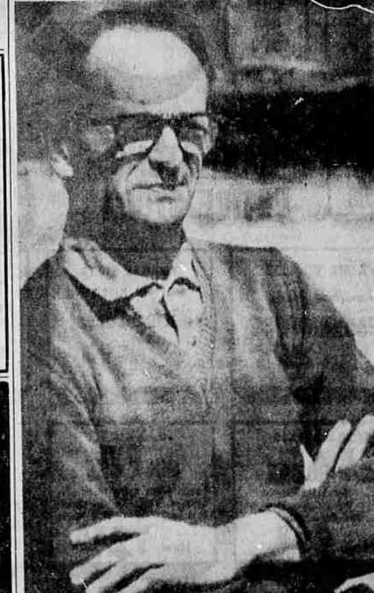
AWAITS TRIAL —Former Nazi leader Adolf Eichmann, who is charged with mass extermination of Jews during World War II, calmly suns himself at Tegart Fort prison near Nazareth during one of his hour-long outdoor stays permitted by prison authorities. Eichmann will be tried in Jerusalem starting April 11.