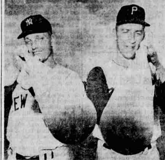
MOST VALUABLE MEET —The world champion Pittsburgh Pirates of the National league and the New York Yankees of the American league met for the first time yesterday since the 1960 world series. Pittsburgh won the exhibition game at Fort Myers, Fla., 9-2. Showing their big bats, above, are Roger Marris, left, of the Yankees, and Dick Groat of the Pirates, most valuable players of their respective circuits.