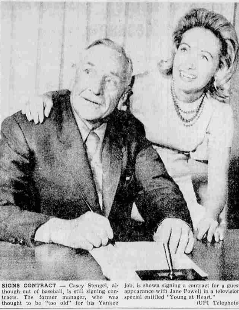
SIGNS CONTRACT - Casey Stengel, although out of baseball, is still signing contracts. The former manager, who was thought to be "too old" for his Yankee job, is shown signing a contract for a guest appearance with Jane Powell in a television special entitled "Young at Heart."

"Maybe it won't hurt if I don't pitch," he said, "because usually I don't help the club before May anyhow."