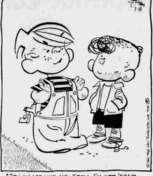
"TRY AN ACT LIKE ME, JOEY. I'M NOT 'FRAD OF NOOTHIN'.....'CEPT A FEW THINGS."