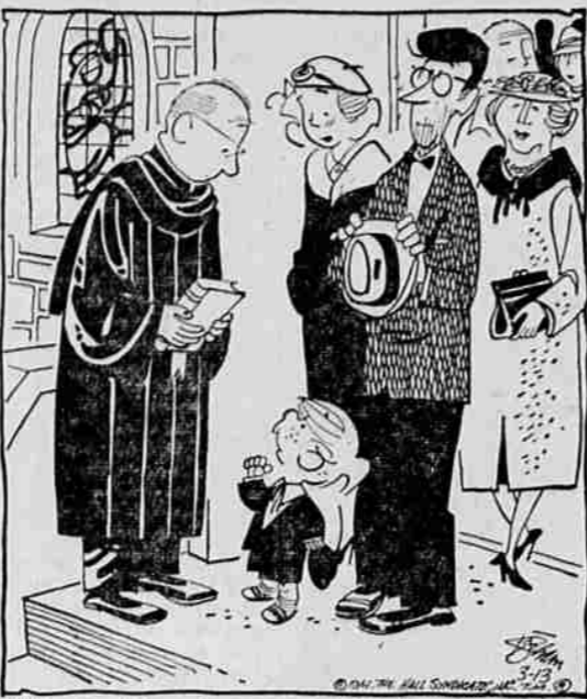
"WHAT ARE YOU GONNA BUY WITH MY DAD'S QUARTER?"