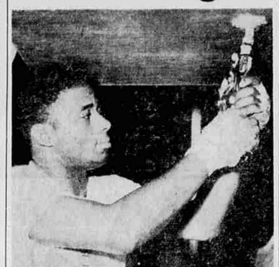
FLOYD PATTERSON Defends Title Tonight

Miami Beach - (UPI) - Here's the tale-of-the-tape for Monday night's Floyd Patterson-Ingemar Johansson heavyweight title fight: