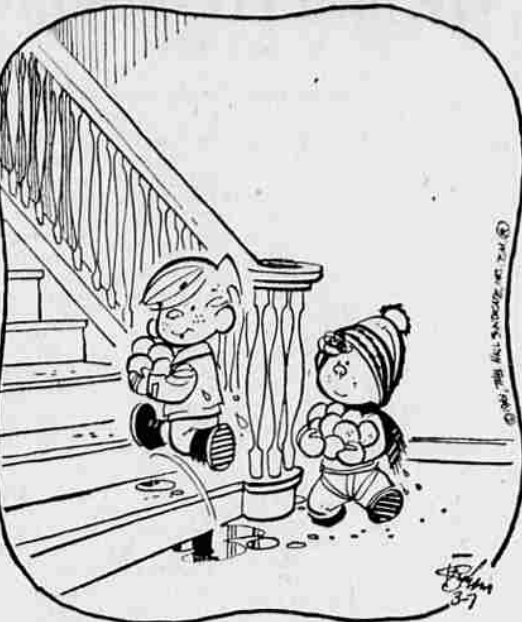
*WHEN YOU THROW 'EM OUT THE WINDOW YOU DON'T HAVE TO RUN WHEN YOU HIT SOMEBODY!