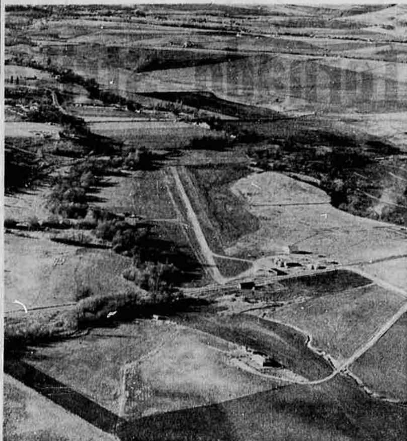
ASHLAND AIRPORT — Plans are in the works for development of the Ashland airport. Extension of the runway an additional 500 feet and widening it 50 feet are possible developments. The present runway is 2,670 feet long and 50 feet wide. Acquisition of land is the major problem in developing the facility. Sumner Parker, of Ashland, owns and operates the airport, in the center of the picture.