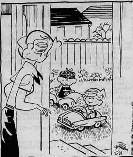
"ME AN DEWEY ARE GONNA PLAY DRIVE-IN MOVIE, AN' YOU'RE GONNA BE THE NICE LADY THAT RUNS THE SNACK BAR!"