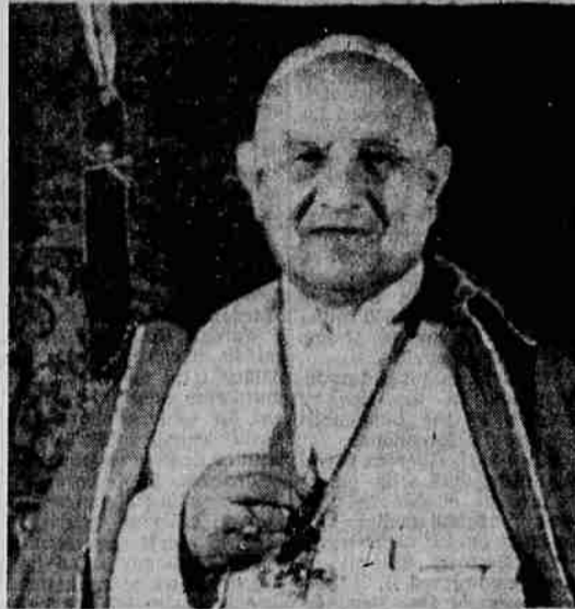
BETTER RELATIONS SEEN — Vatican officials said that Queen Elizabeth's visit to Pope John XXIII is certain to further improve relations between the Roman Catholic and Anglican churches. A high Vatican source, noting that the climate for such a visit was unusually favorable, said the British monarch and her husband, Prince Philip, would be welcomed with all the pomp and pageantry of the Pope's court when they arrive May 5. Britain's queen is shown in the upper photo while below is Pope John.