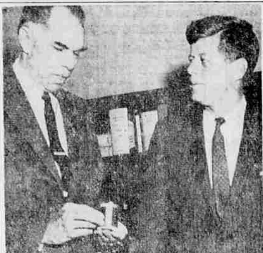
Salem— —Gov. Mark Hatfield Friday sent a telegram to President Kennedy confirming that Oregon is doing all it can to stimulate the economy.