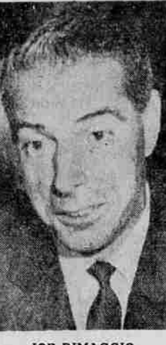
JOE DIMAGGIO Spring Training Aide