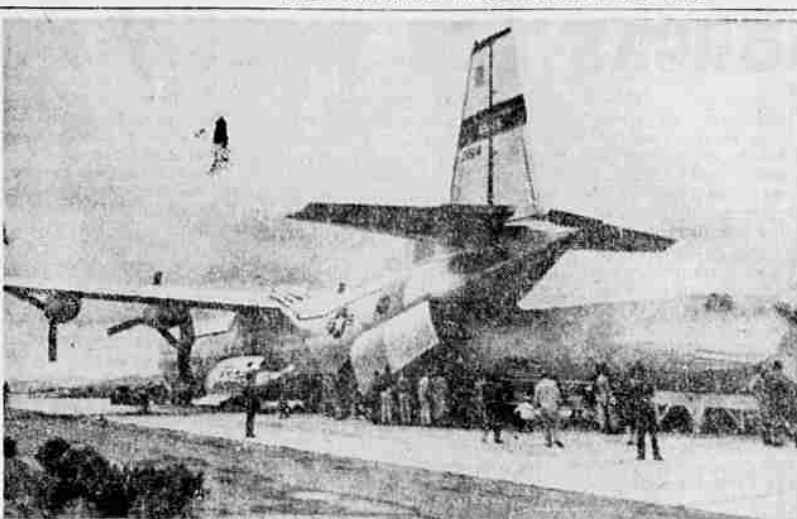
MISSILE LOADED - An Atlas missile, right, is loaded from a trailer into a MATS C133 Cargomaster plane at Travis Air Force Base for shipment to the facilities at Cape Canaveral. Travis' 84th Air Transport Squadron is the only organization involved in the Atlas missile lift. Even the outsized C133 is a close fit for the huge missile—with clearance of parts in some instances less than an inch.