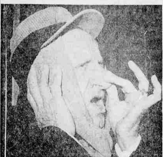
COLD BEAK —Tweaking his king-sized nose, comedian Jimmy Durante registers a woeful expression in the grip of bitter cold that invaded New York City last week. A massed Arctic air dragged the temperature below zero and established a new low for the year.

Japan stands to lose some $115 million annually in U.S. purchases as a result of the "save-the-dollar" drive, trade sources here calculate. Technically, Liao will be repaying a visit to Red China