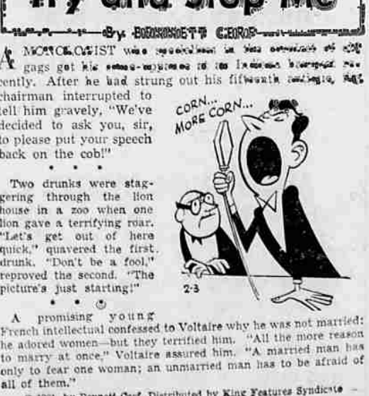
© 1961, by Bennett Corp. Distributed by King Features Syndicate

Men and Moors (continued) To the Editor: After sitting and observing people walking in and out of a super market with automatic doors, I have come to the conclusion that some men are not worthy for them.