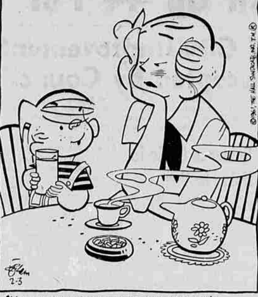
"YOU KNOW WHAT WOULD GO GOOD WITH THIS GLASS OF MILK? A GLASS OF ROOT BEER!"