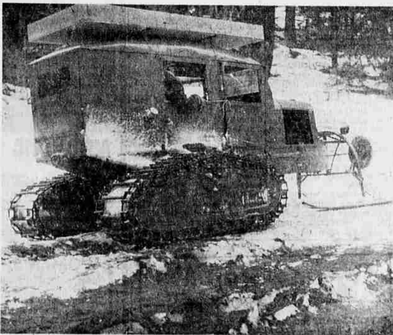
SNO-CAT —Transportation to the top of Mt. Ashland has been taken care of to date by this Sno-Cat operated by Thomas Parker, Ashland contractor and investor. The vehicle can accommodate four inside the cab. Skiers are pulled up behind the Sno-Cat.