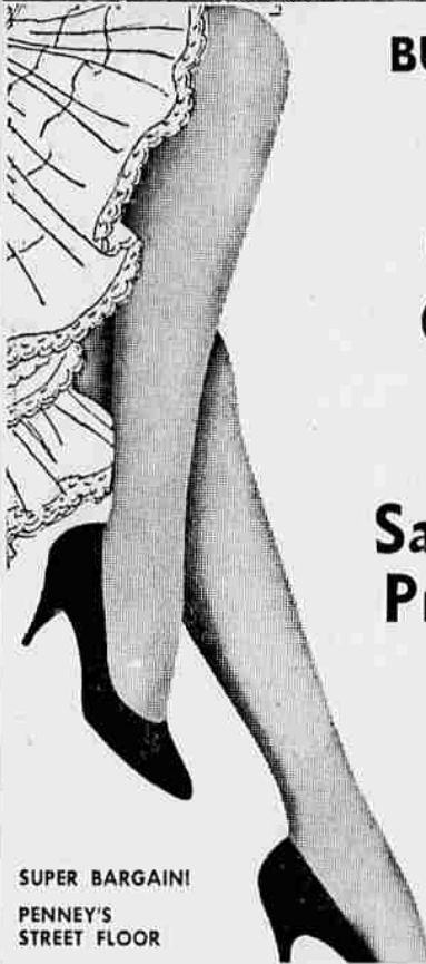
SUPER BARGAIN! PENNEY'S STREET FLOOR