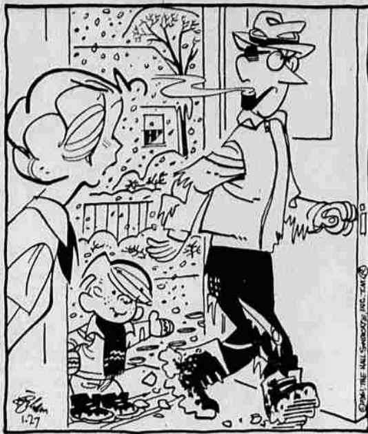
"BOY, IS THIS MY LUCKY DAY! DAD TRIED MY OLD SLED, AN' NOW I'M GONNA GET A NEW ONE!"