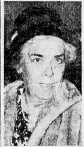
DR. JANET TRAVELL Considered 'Genius'

Kennedy Selects Woman Doctor For White House