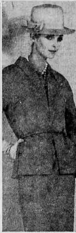
New York - Broader shoulders, short sleeves and a waistline that indents where nature placed it are featured in the 1961, silhouette of Ben Zuckerman, New York designer. The buttonless suit of lightweight red wool jersey has a matching leash belt.

The museum is open Tuesday through Sunday from 1 p.m. until 5 p.m., and on Wednesdays it is also open from 7 p.m. until 10 p.m.