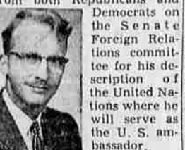
Sen. Wayne Morse called it the finest statement he had seen on the "symbolism of the U.N." He said it ought to be required reading.