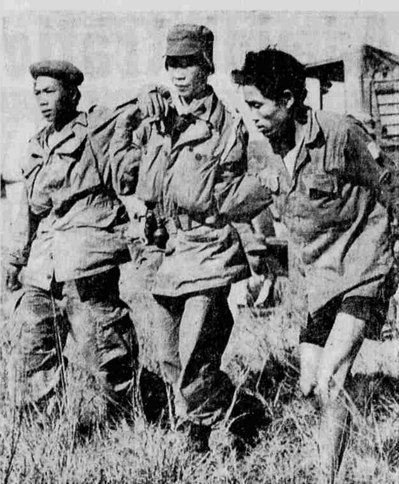
WOUNDED SOLDIERS REMOVED —Wounded royal Laotian soldiers were evacuated from the front lines are shown at Vientiane military airport. Laotian government forces consolidated their hold on the village of Vang Vieng toward the end of last week. Pilots of planes which arrived at Vientiane with wounded soldiers reported heavy firing around Vang Vieng, indicating government troops had established contact with the rebels.