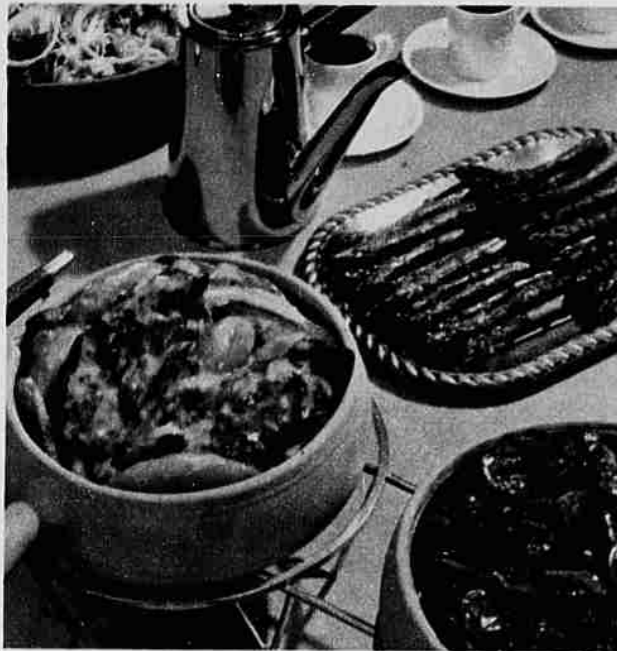
Chicken and Sweet Potato Casserole paired with Sauerbraten

Moderne is doubly delicious served for a buffet with asparagus spears, a fresh green salad, and steaming coffee.