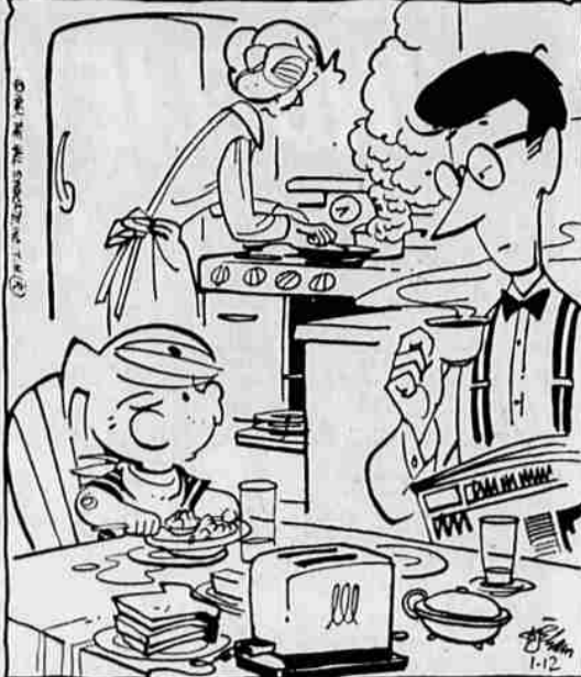
"BOY, HAVE I GOT A BIG DAY IN FRONT O' ME! I'M GONNA GIVE JOEY CLIMBIN' LESSONS!"